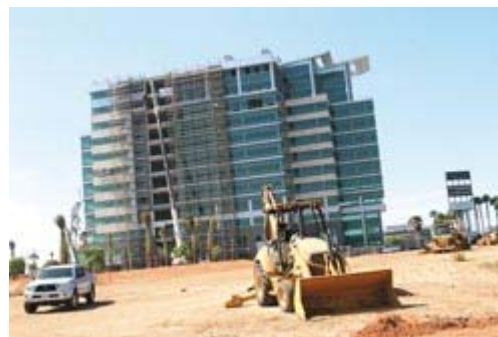
Construction crews are removing the top portions of the controversial Kearny Mesa office tower.

Alterations to Kearny Mesa's skyline will barely be noticeable when a controversial high-rise near Montgomery Field is lowered 20 feet. San Diego developer Sunroad Enterprises was ordered to lower the Centrum 12 office building on Kearny Villa Road to comply with city requests following safety concerns raised by the Federal Aviation Administration and California Department of Transportation.